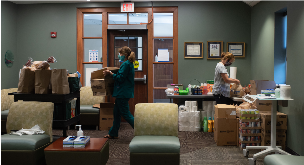
Ohio University-HCOM's Community Health Program's Taking Hope on the Road project provides care packages, distributed through a no-contact home delivery system, to Heritage Community Clinic patients throughout Southeast Ohio.